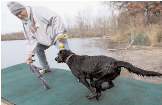
Buckeye Dock Dogs teaching dogs to jump from the dock.